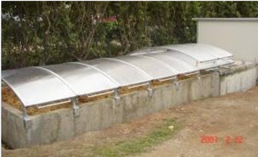
Lycée agricole d'Aix Valabres (13)