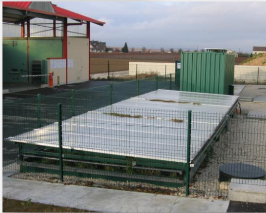
CSGV à Avize (51)