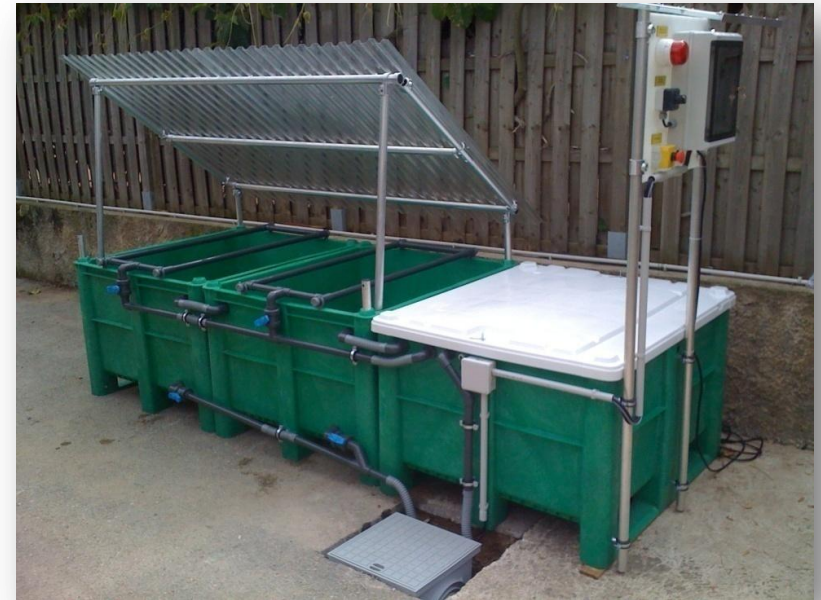
Ville de Roquebrune-Cap Martin (06)